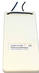
AURA-FLOW +QN Dimensions (mm): 115 x 60 x 14 Weight: ca. 105 g